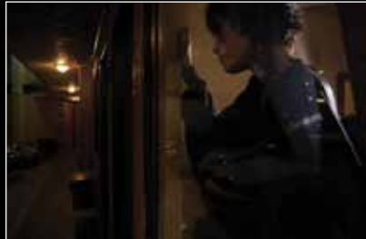
SJ6002 | accused dress | black

Lefties Showroom Cooper Building Suite 525 860 S. Los Angeles Street Los Angeles, CA 90014