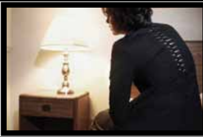
L8002 | spine jacket | black