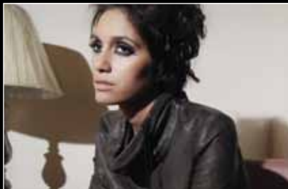
L4001 | strangle sweater | gunmetal