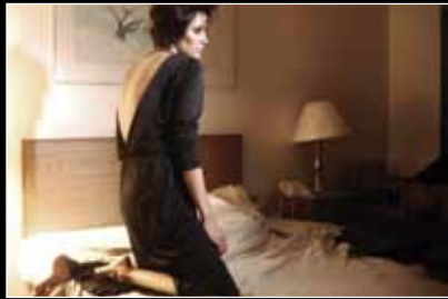
SJ6003 | dawn dress | black