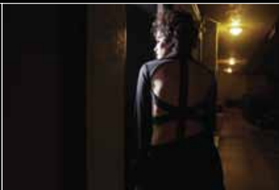
SW8003 | ransom trench coat | black