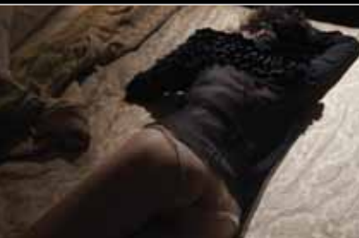
SiC2006 | daphne shirt | black