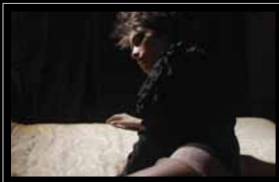
SiC2006 | daphne shirt | black