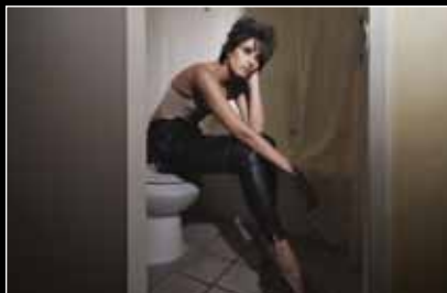
L1001 | agony pants | black